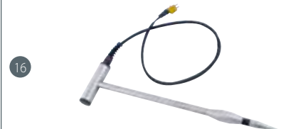
GSF 50TF (110 cm) Item No. 601312 GSF 50TFK (43 cm) Item No. 601313

Material moisture insertion probe, (without temperature sensor) for measurements at measuring depths of up to 40 cm or 107 cm, incl. 1 m connection cable. Suitable for: wood chips, wood wool, wood shavings, straw, hay, grain, sawdust, etc.