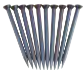
GST 91/40 Item No. 601275 Steel pins 10 steel poles, 40 mm long, Ø 2.5 mm, in a plastic box