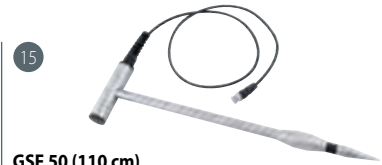
GSF 50 (110 cm) Item No. 601305 GSF 50K (43 cm) Item No. 601308

Material moisture insertion probe, (without temperature sensor) for measurements at measuring depths of up to 40 cm or 107 cm, incl. 1 m connection cable. Suitable for: wood chips, wood wool, wood shavings, straw, hay, grain, sawdust, etc.