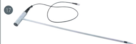
GSF 40 (67 cm) Item No. 601316 Material moisture insertion probe, (without temperature sensor) for measurement in pressed bales at a depth of 60 cm, incl. 1 m connection cable. Suitable for: pressed hay and straw bales, grain

Material moisture insertion probe, with temperature sensor for measurement at measuring depths of up to 40 cm or 107 cm, incl. 1 m connection cable. Suitable for: wood chips, wood wool, wood shavings, straw, hay, grain, sawdust, etc.