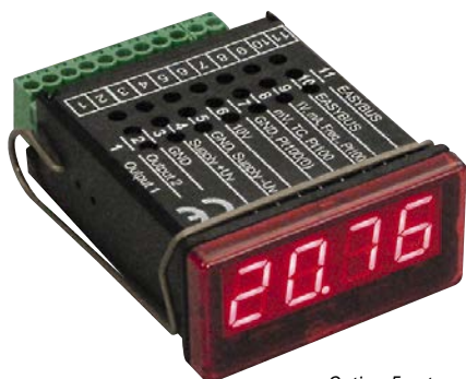
Option: Frontpanel with push buttons (frontpanel without buttons included in delivery)