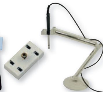
GEH 1 with probe